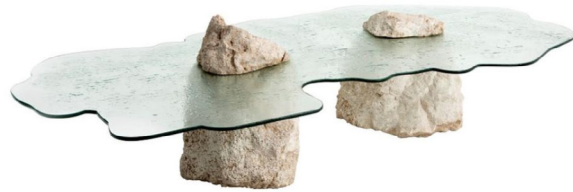
Mint exhibit by Cypraea Il Rodrigues LONDON DESIGN FESTIVAL