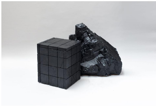
Mint exhibit by Jesper Erikson's "Coal: Post Fuel" LONDON DESIGN FESTIVAL